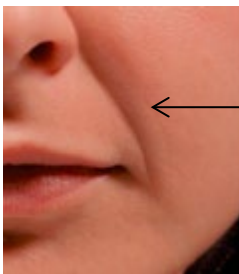
Figure 1. Facial Nasolabial Fold

BELOTERO BALANCE® (+) is used to smooth out and fill in moderate to severe folds or wrinkles, such as the creases that extend from the corner of the nose to the corner of the mouth ( nasolabial folds ) as shown in Figure 1 below.